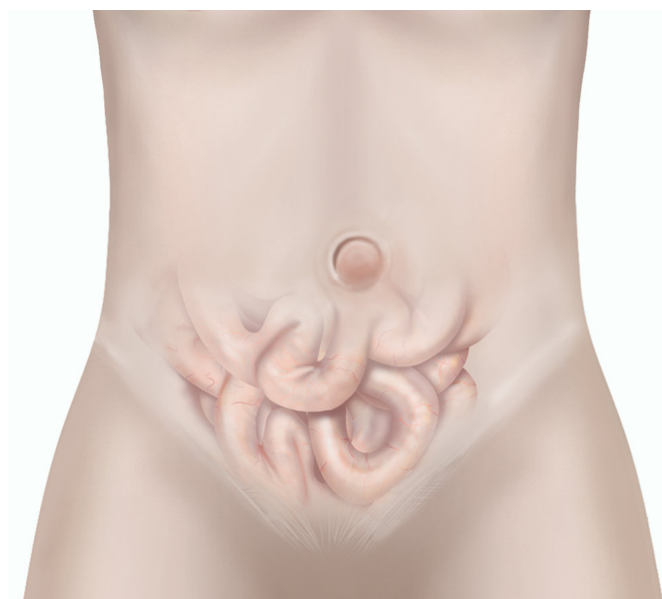
Figure 1 An umbilical hernia

Weak spots can develop in the layer of muscle, resulting in the contents of your abdomen, along with the inner layer, pushing through your abdominal wall. This produces a lump called a hernia (see figure 1).